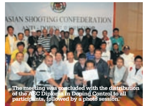
The meeting was concluded with the distribution of the ASC Diploma in Doping Control to all participants, followed by a photo session.