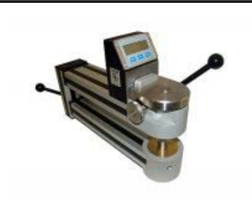
Table for Stiffness Measurement Device